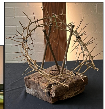
Easter symbols by Dorothy Bath