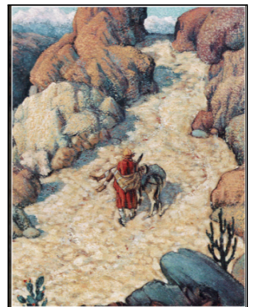
Image: WPCU feature image, 'Good Samaritan in Tibet' © by artist Frank Wesley

The National Council of Churches in Australia has released resources including material for promotion, a full worship service and eight daily reflections.