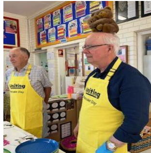
Everyone enjoys pausing to make their correct topping choice.